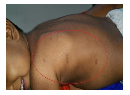
Pic-1 Café Au Lait Spots

Our provisional diagnosis was Type 1 Neurofibromatosis with Spina bifida occulta.